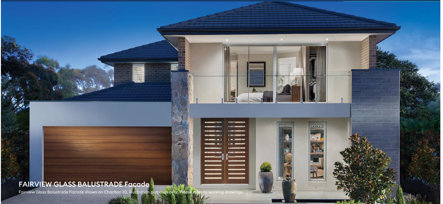
FAIRVIEW GLASS BALUSTRADE Facade

Fairview Glass Balustrade Facade shown on Charlton 33. Illustration purposes only. Please refer to working drawings.